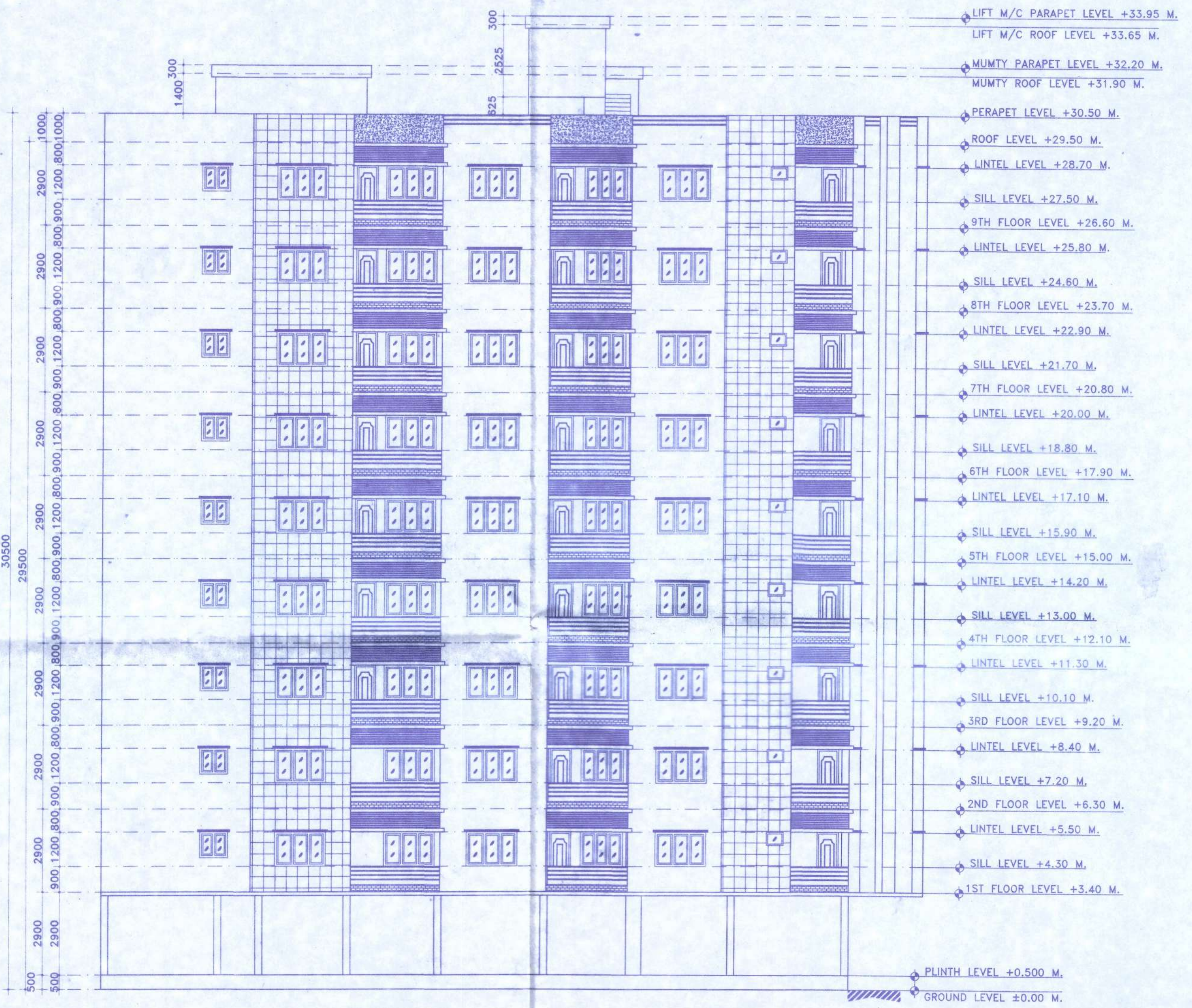
A FRONT SIDE ELEVATION SCALE: 1:100

TITLE:- ELEVATIONS, BASEMENT FLOOR PLAN.